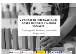
Figure 28. Promotional poster for the congress