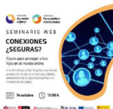
Figure 4. Promotional Poster for the Webinar