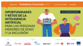
Figure 37. Poster for the conference day