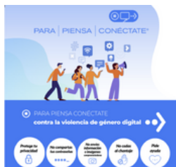
Figure 12. Workshop promotional flyer