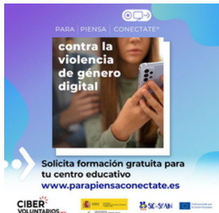
Figure 14. Promotional poster for the campaign