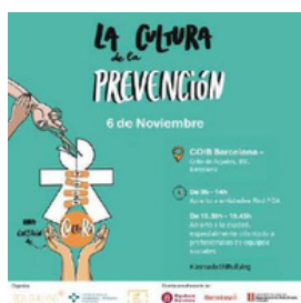
Figure 3. Image of the programme