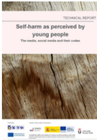
Figure 33. Campaign creative