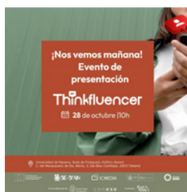
Figure 20. Promotional creativity for the event