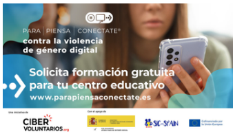
Figure 13. Campaign creativity