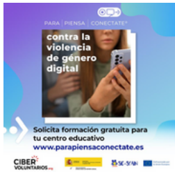
Figure 11. Campaign Creative