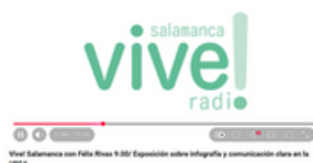
Figure 30. Promotional banner