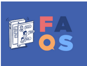
Figure 18. Campaign Creative