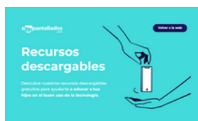
Figure 15. Campaign Creative