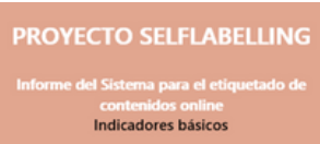
Figure 9. Cover of the Report on the System for Online Content Labelling