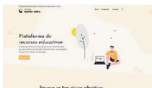
Figure 5. Screenshot of the Educational Resources Platform