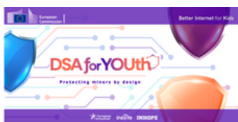
Figure 24. Campaign image