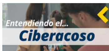
Figure 26. Campaign image