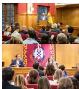
Figure 7. Image of the Event