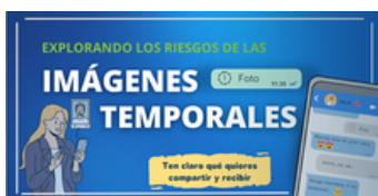
Figure 25. Initiative image