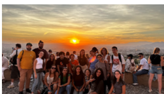
Figure 21. Group of participants