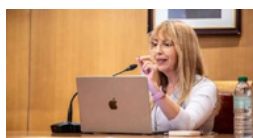
Figure 6. The President of the Anna Plans Foundation