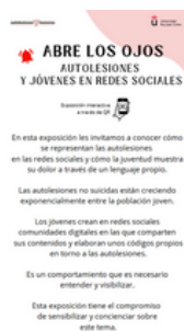
Figure 32. Informative poster for the exhibition