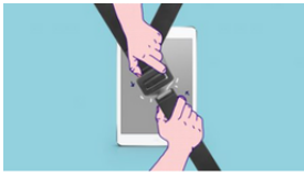
Figure 16. Promotional Creative for the Articles