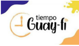
Figure 8. Tiempo Guay-fi logo