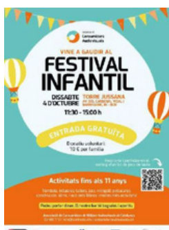
Figure 2. Poster image