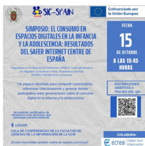
Figure 23. Promotional poster for the Symposium