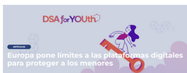
Figure 19. Creativity accompanying the article