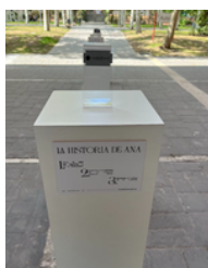
Figure 31. Promotion of the exhibition