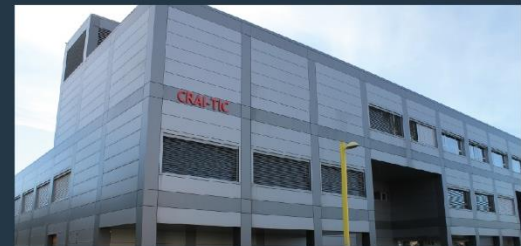
3 CRAI-TIC S/N, Crai-Tic building, Campus Vegazana 24071 León