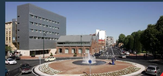
4 AUDITORIO CENTRO CÍVICO "LEÓN OESTE" Avda. La Magdalena, 1 - 24009 León