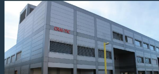
3 CRAI-TIC S/N, Crai-Tic building, Campus Vegazana 24071 León