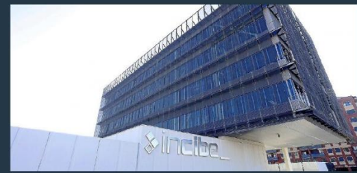
1 INCIBE INCIBE building, Av. José Aguado, 41 24005 León