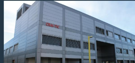
3 CRAI-TIC S/N, Crai-Tic building, Campus Vegazana 24071 León