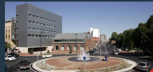
4 AUDITORIO CENTRO CÍVICO "LEÓN OESTE" Avda. La Magdalena, 1 - 24009 León