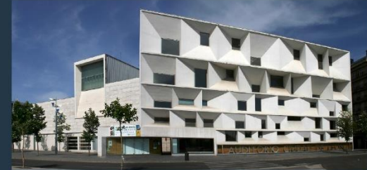
2 AUDITORIO CIUDAD DE LEÓN Av. de los Reyes Leoneses, 4, 24008 León