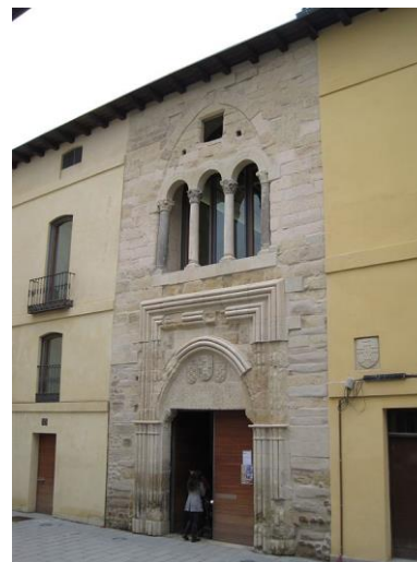
Count Luna's Palace