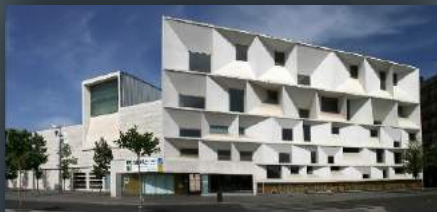
3 CIUDAD DE LEÓN AUDITORIUM