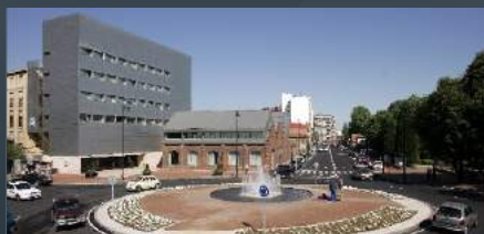
4 LEÓN OESTE COMMUNITY CENTRE AUDITORIUM